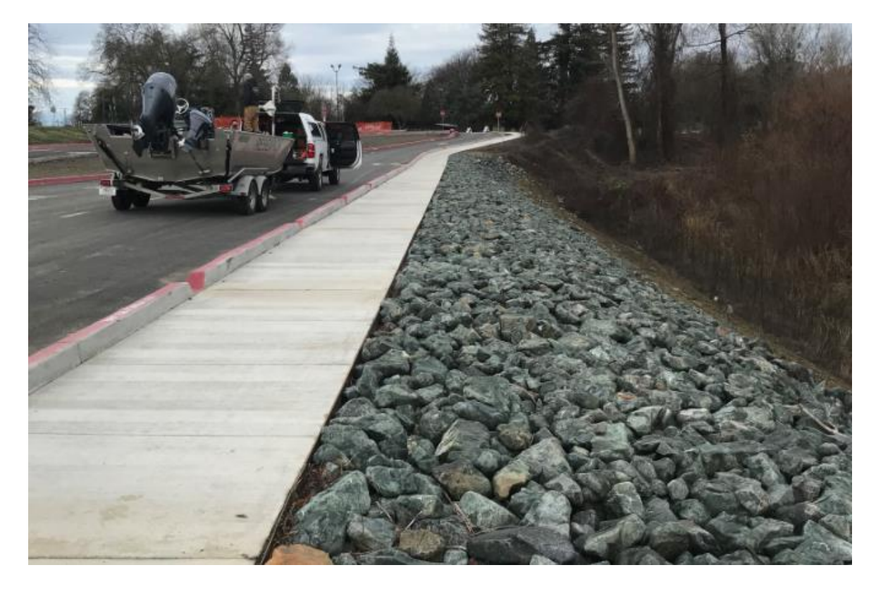
Accessible pathways and slope protection

Funding from the Harbors and Watercraft Revolving Fund comes from revenue generated by vessel registration fees, repayments of DBW loans provided to public and private harbors, and vessel fuel tax.