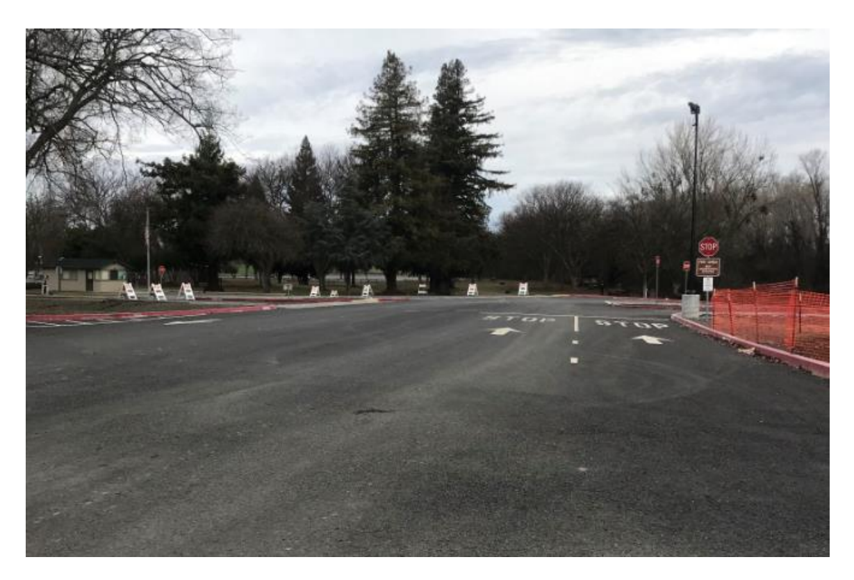
Boat Launching Facility entrance roadway