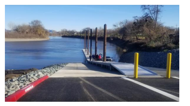
Top of the boat ramp